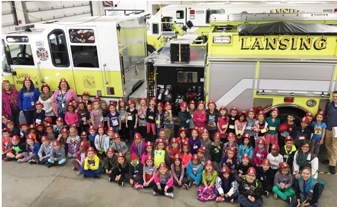
Visiting the Lansing Fire Department

R.C. Buckley Elementary School has had a great first half of the school year. From band, orchestra, and chorus concerts to participating in "Read Around Buckley," students have been very busy!