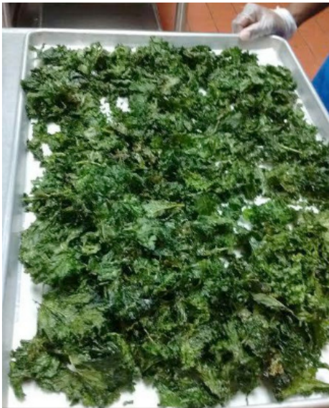
Lansing Central School District October 24, 2016 · 📍

Our LCSD food service program serves up fresh baked kale chips! A 4th grade elementary student tells me that I should try them and that they taste delicious! Kudos to our LCSD food service department.